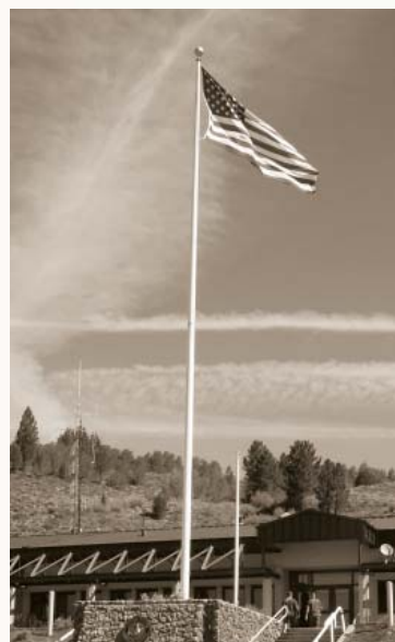
The flag flies over the Marine's Mountain Warfare Training Center located on Highway 108 at Pickle Meadow, 21 miles northwest of Bridgeport. The center occupies 46,000 acres of Toiyabe National Forest. The Marine Corps trains Marines in mountain and cold weather operations. The base is at 6,762 feet, with elevations in the training region ranging to just under 12,000 feet.

Highway 120, Tioga Pass, is the eastern gateway to Yosemite National Park. Tioga Pass takes visitors through Tuolumne Meadows, Yosemite Creek and Wolf Creek. The pass is open, weather permitting, from mid-May until late October. When open this offers access from the San Joaquin Valley to the Eastern Sierra.